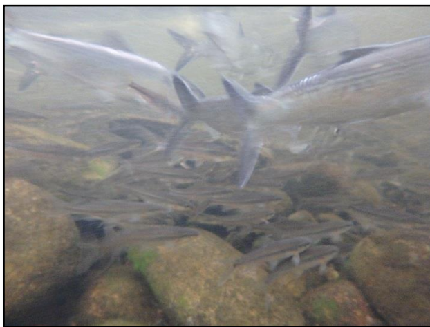
Actively spawning blueback herring below the Leesville Dam, Salmon River. Large numbers of spottail shiners (underneath) were swarming the area, feeding on eggs. An osprey was fishing overhead.