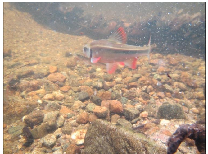
A male common shiner feeding over newly exposed gravel beds in the stretch of stream formerly occupied by Ed Bill Pond. This native minnow thrives in free-flowing streams. If you enlarge the photo, you may see whitish bumps over his eye—nuptial tubercles. A temporary feature during spawning season, like a hook jaw on a salmon.